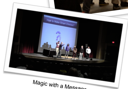
Magic with a Message